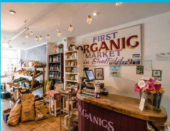
A thriving independent shopping scene