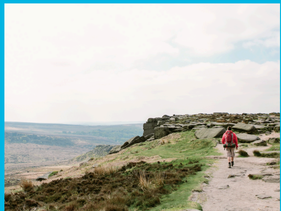
World-class cycling, climbing and hiking