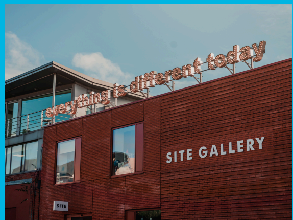
Five multiscreen cinemas and nine art galleries