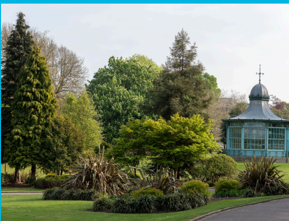
Among the greenest cities in Europe