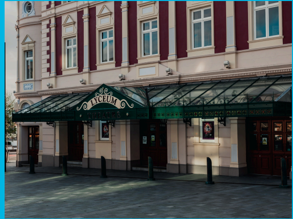
The largest UK theatre complex outside of London