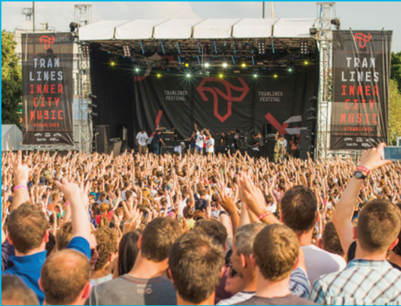
Home to major music and film festivals, attracting over 100,00 people